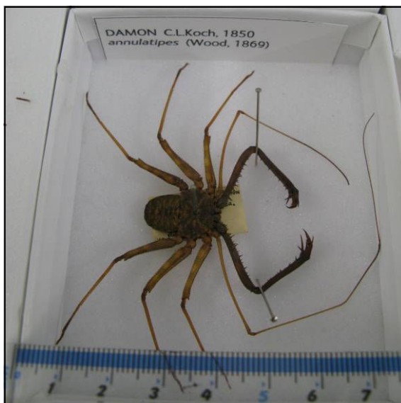
Fig. 1. Amblypygi (whip spiders) – Damon annulatipes (Wood, 1869).

A 2% solution of Decon 90 was used, as this was found to be the more effective strength by Beccaloni (2001). Five grams of TSP in 1L distilled water, with 5ml of Agepon was used, as this solution strength was recommended by Jocque (2008) and Nellist (2009). The specimens were fully immersed in the test chemicals in tubes or small jars (Fig. 5). Beccaloni (2001) recorded results after 17 hours immersion in the test chemicals. This approach was not ideal because several specimens did not successfully hydrate and Nellist (2009) found that successful hydration in A&TSP occurred after an immersion time of between 10 and 15 days. It was therefore decided to monitor the specimens, and remove them once they had sunk in the test chemical, which would indicate successful hydration. The deterioration of specimens is considered totally undesirable, so where specimens began to deteriorate, even when they were still floating in the wetting agent solution, they were removed. The specimens were then thoroughly washed in distilled water and transferred into 80% IMS. This resulted in various immersion times between 5.5 and 16 days.