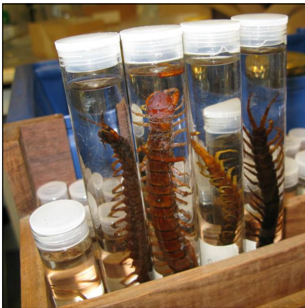
Fig. 5. Centipede specimens immersed in the test wetting agent solutions.