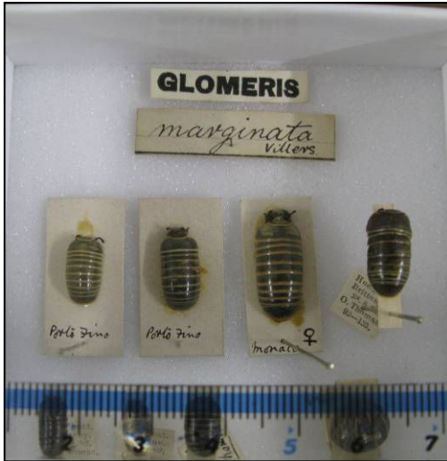
Fig. 3. Diplopoda (millipedes) – Glomeris marginata (Villiers, 1789).