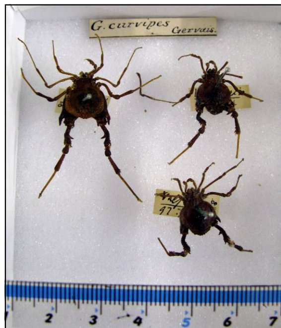
Fig. 2. Opiliones (harvestmen) – Pachylus chilensis (Guer.-Men.).