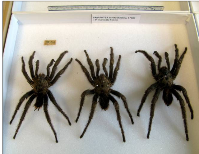
Fig. 4. Araneae (Theraphosidae) – Paraphysa scrofa (Molina, 1788).