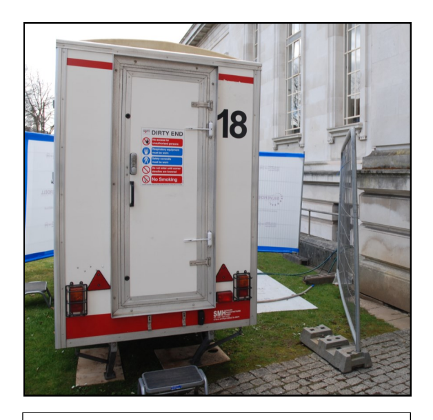
Fig. 10. Typical trailer-style decontamination unit used by asbestos contractors. This may be placed inside a storage area if space allows, although here it is show placed external to the building. National Museum of Wales decontamination work 2013.

this way it need not be removed. Enclosure in a polyethylene sealed bag will ensure that if the inner container should break, the contents will be contained. Glass containers are not recommended for repackaging. If specimens are already contained in this way it is better to retain the glass container and double-bag using and outer layer of a heavier gauge (e.g. 300\mu m) to provide protection in case the glass breaks.