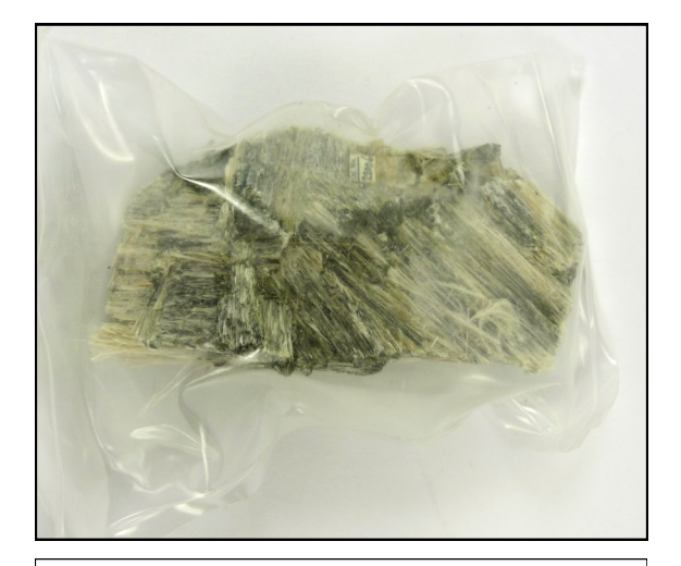
Fig. 3. Single packaged specimen of anthophyllite (OUMNH-Min22006, specimen c.95 x 50mm). Scandinavia, particularly Finland, is the main producer of commercial anthophyllite.

The volume of asbestos specimens in mineral collections will obviously vary from one museum to another, but is likely to be small. For example the National Museum of Wales mineral collection (34,000 registered specimens) contains just 0.5% asbestos minerals, whereas the Oxford University Museum of Natural History, which has similar sized total holdings, includes a substantial asbestos mineral research collection so contains 1.7%.