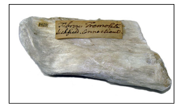
Fig. 6. Fibrous tremolite from the USA (OUMNH-Min6784, specimen c.93 x 40mm).