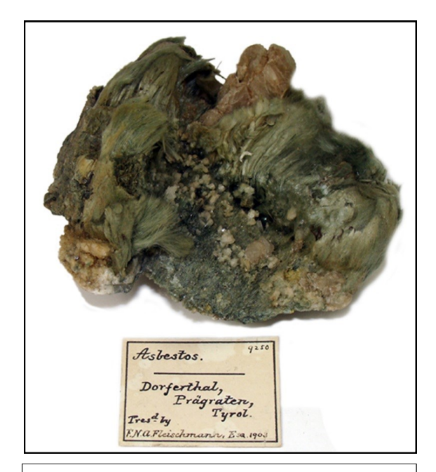
Fig. 1. Asbestiform actinolite from Austria (OUMNH-Min9250, specimen c.90 x 80mm).

publication of 2011, which presents an agenda for research to provide more robust evidence supporting or disproving this claim.