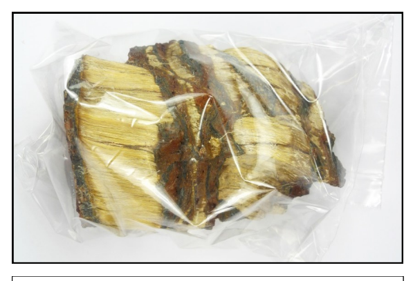
Fig. 2. Single packaged specimen of grunerite from South Africa (OUMNH-Min21564, specimen c.150 x 135mm). This mineral is known commercially as brown asbestos or amosite (from the acronym for the 'Asbestos Mines of South Africa').