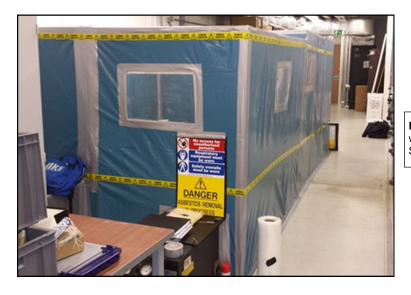
Fig. 8. Asbestos enclosure erected within storage area at National Museum Scotland.

the location and access route to their decontamination unit (Fig 10), which they will need for changing and disposing of contaminated personal protective equipment (PPE).