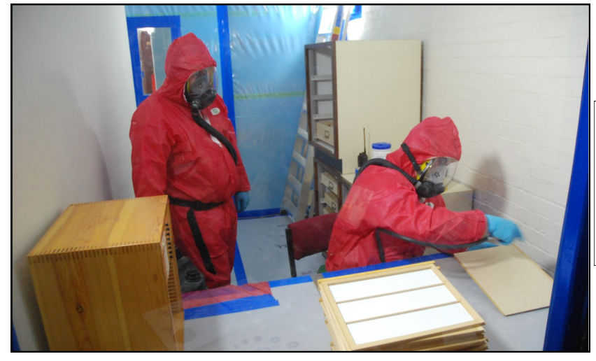
Fig. 9. View through large inspection window in enclosure (frame of window visible on right of photo) at the National Museum of Wales. There was inadequate space to fit the unit in the store area, so part of a corridor was used.

If specimens are to be encapsulated, the minimum standard for containment which will enable safe handling by staff without use of personal protective equipment, is to seal the material in two layers of transparent protective covering. The encapsulated specimens can then be stored as normal, in new, clean card trays, and managed within normal storage furniture. Double-bagging in sealable polyethylene bags is quick, cheap and effective for basic storage as long as food/conservation grade bags are used. Alternatively inner containers could be heat-sealed polyethylene tubing, or polystyrene tubes or jars. If the sample is already contained in