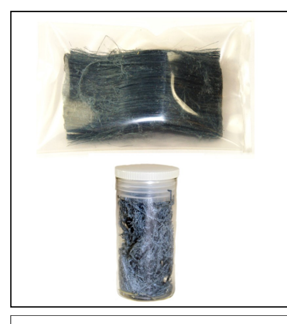
Fig. 5. Crocidolite, also known as blue asbestos, is a variety of the amphibole riebeckite. (top: OUMNH-Min16130, specimen c.60 x 32mm; bottom: OUMNH-Min26175 from Australia, 53mm high tube).

ite (commercially known as brown asbestos) (Wagner et al., 1985) and this may be a product of voids in the crystal lattice in addition to its fibrous nature (Coffin & Ghio, 1991). At present these minerals are not included within legislation. Erionite was original identified as a hazard in altered volcanic rocks in the Cappadocia region of Turkey but has been identified by the US Geological Survey in twelve US States (Sheppard, 1996). Wollastonite, palygorskite (referred to as attapulgite in the text) and sepiolite are also mentioned in the literature (WHO, 1986), and implicated as potentially hazardous, but Bailey et al. (2003) suggest that this status is unfounded. Once again until established as safe, the best approach is to treat all fibrous minerals with care to prevent fibre release.