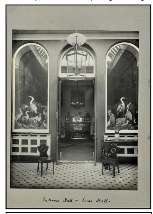
Figure 1. A photograph dating from c.1910 of the doorway between the main entrance hall and the inner hall at Edenhall, showing two displays of taxidermy birds, many of which appear to be either herons, egrets or bitterns (see also comments in text).

The catalogue provides limited information on the original style of the collection. However, the various different categories of the catalogue (described above) indicate that they were all initially mounted (apart from one, the Pine Marten Martes martes (Linnaeus, 1758), for which information is wanting (Museum records indicate that the specimen was reduced to a skull). Furthermore, the final section of the catalogue, provides a list of specimens which were essentially in cases, which number 65 of the specimens. Some of the specimens including herons, were cased on either side of the inner doorway in the Edenhall entrance hall, forming a fine decoration to the elegant mansion (Fig. 1). This shows two displays of taxidermy birds, many of which appear to be either herons, egrets or bitterns (Ardeidae). Of the seven larger birds depicted, at least five show characteristics of Grey Herons Ardea cinerea Linnaeus, 1758, a sixth (the upper bird on the right of the display to the left of the doorway) has the darker plumage and long,