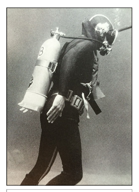
Fig 2. The first Natural History Museum SCUBA dive team was setup in the 1960s, here diving at the 35m Siboglinum fiordicum depths in the early 1970s. Early observations of living siboglinids were an important clue in understanding their evolutionary history.